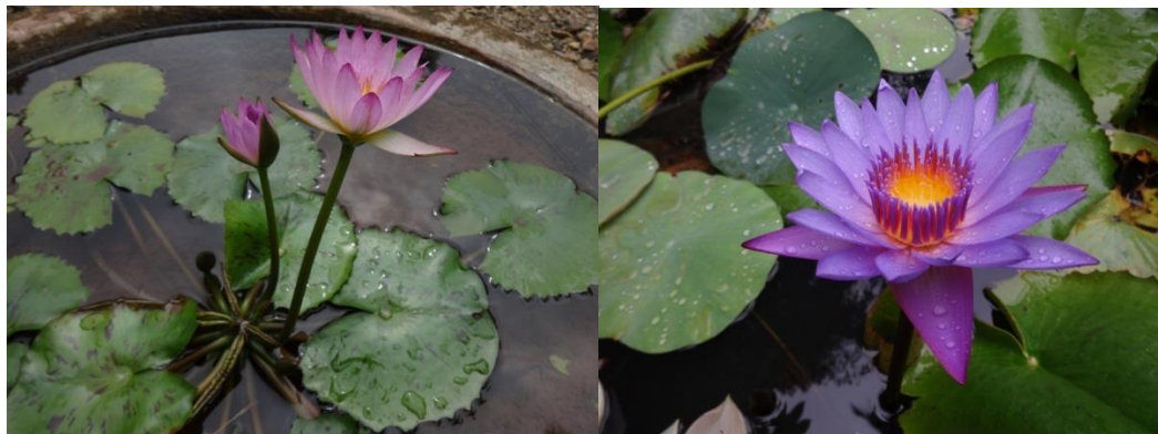
Fig. 1e. Accession 9 and accession 10