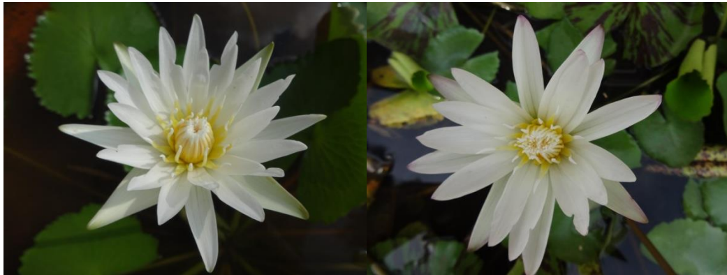
Fig. 1a. Accession 1 and 2