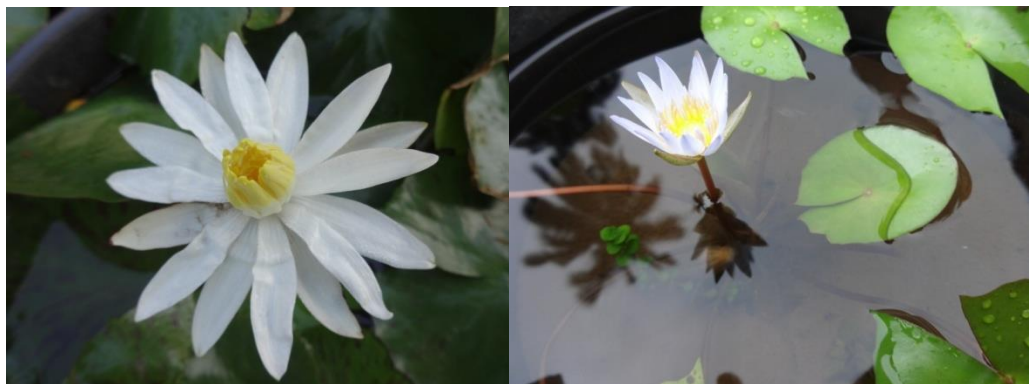
Fig. 1c. Accession 5 and 6