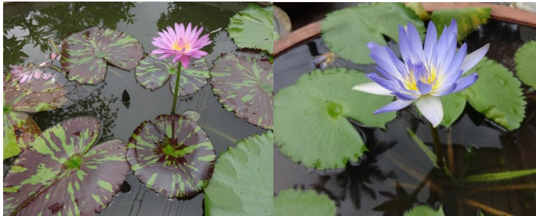
Fig. 1d. Accession 7 and accession 8