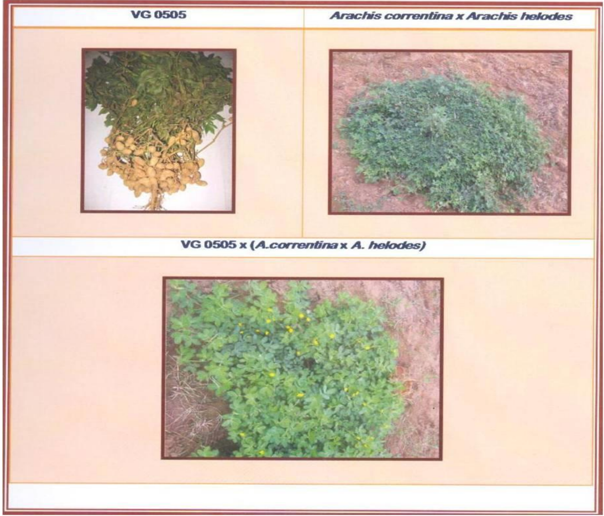
Figure 1 Arachis hypogaea x (Arachis correntina x Arachis helodes) (3x)