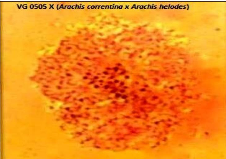
Figure 2 Metaphase stage in Arachis hypogaea x (Arachis correntina x Arachis helodes) (3x)