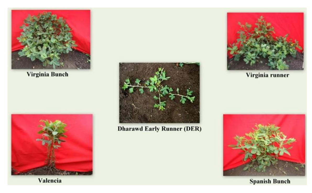
Fig. 1. DER and its mutants representing ssp. hypogaea and ssp. fastigiata