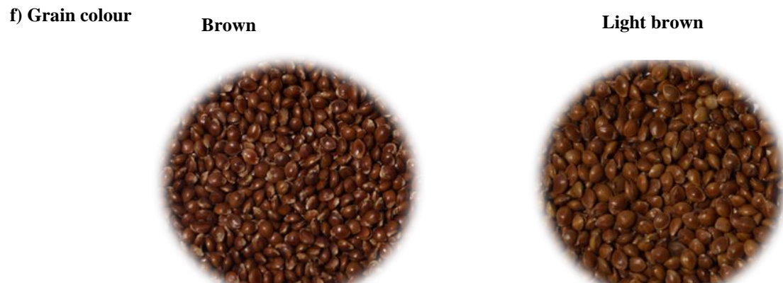
Fig.1. Morphological differences among kodo millet genotypes