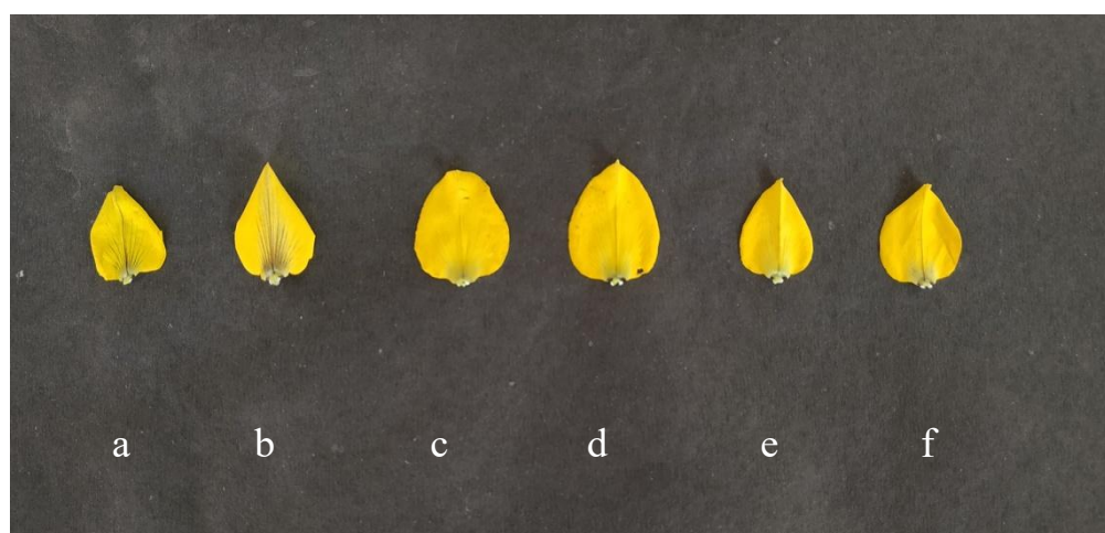
Fig.3. Standard petal patternings on various genotypes

a)CO 1 b) SUIN 037 C) K 12 Yellow d) JRT 610 e) SUIN 053 f) SN 23