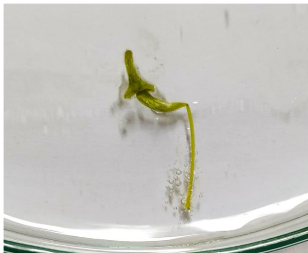
Fig.2. Receptive stigma generating bubbles

143.6 cm and K12 Yellow being the tallest at 184.4 cm. The height of the first branching ranged from 83.6 cm in SUIN 053 to 133.4 cm in K 12 Yellow. Thirty days after sowing, the genotypes were observed to have about 2 to 5 secondary branches. All the genotypes showed determinate growing habits and had about 7 to 9 grooves on their stem. All the leaves were green in colour, lanceolate in shape and alternate in the arrangement. The leaf length varied from 9.84 (CO 1) to 14.5 cm (K 12 Yellow), while leaf breadth ranged from 1.9 (CO 1) to 3.3