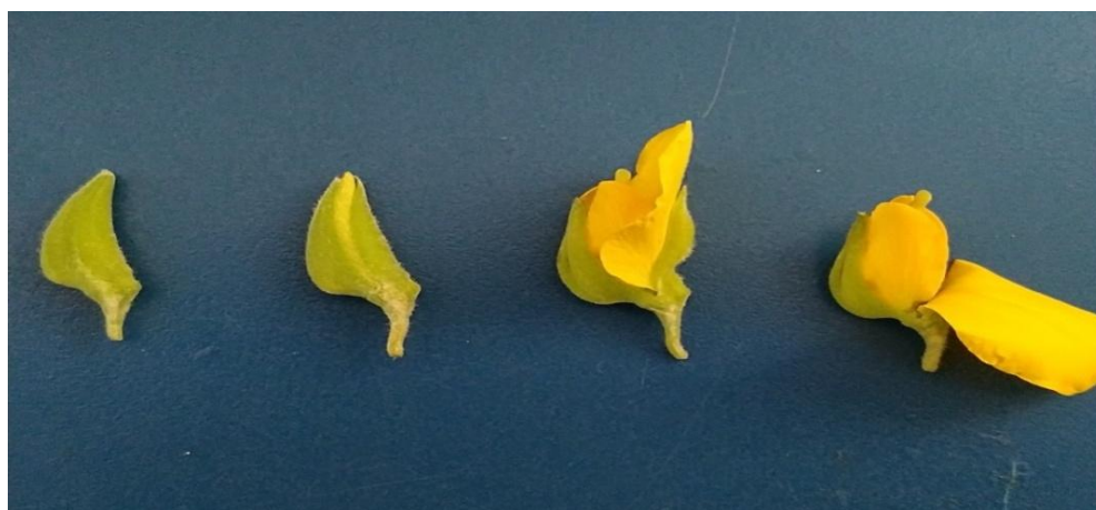
Fig.1. Various stages of flower opening in Crotalaria juncea

In the present investigation, a total of 36 morphological characters consisting of sixteen biometrical ( Table 1 ) and twenty qualitative characters ( Table 2 ) were recorded in six sunnhemp genotypes namely SN 23, SUIN 053, SUIN 037, K 12 Yellow, JRT 610 and CO 1. The plant height at maturity of the six genotypes varied from 143.6 to 184.4 cm with SUIN 053 being comparatively dwarf at