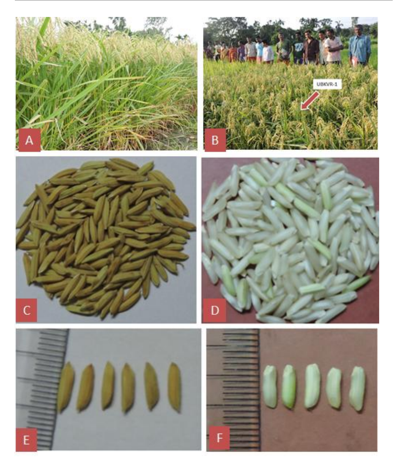
Fig. 1. Pictorial depiction of different features of Uttar Sona (IET 24171). A) Standing crop at famers' field (Shri Bharat Barman, Kharikabari, Unishbisha G.P., Mathabhanga-II, Cooch Behar district); B) Farmers' participatory varietal selection at Patlakhawa G.P. (Cooch Behar-II, Cooch Behar district, West Bengal)- farmers selected Uttar Sona along with other four varieties as best performing varieties; C) Un-dehusked rice of Uttar Sona; D) Dehusked rice of Uttar Sona; E) Length of un-dehusked rice Uttar Sona; F) Length of dehusked rice of Uttar Sona [length: 5.47 cm, breadth: 2.05 mm, L:B ratio- 2.66, gain type- medium slender].