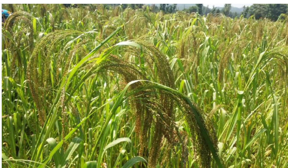
Field View of GV-4