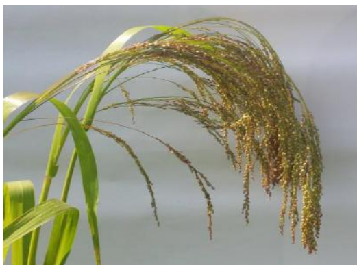
Panicle View of GV-4