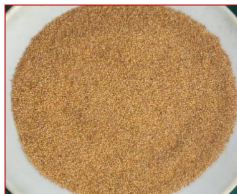
Grain of GV-4