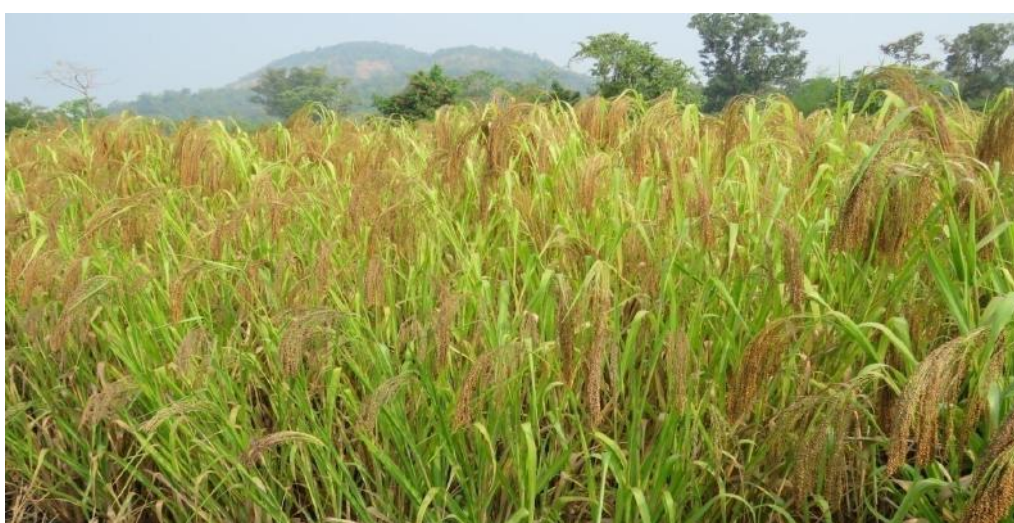
GV-4 at Maturity