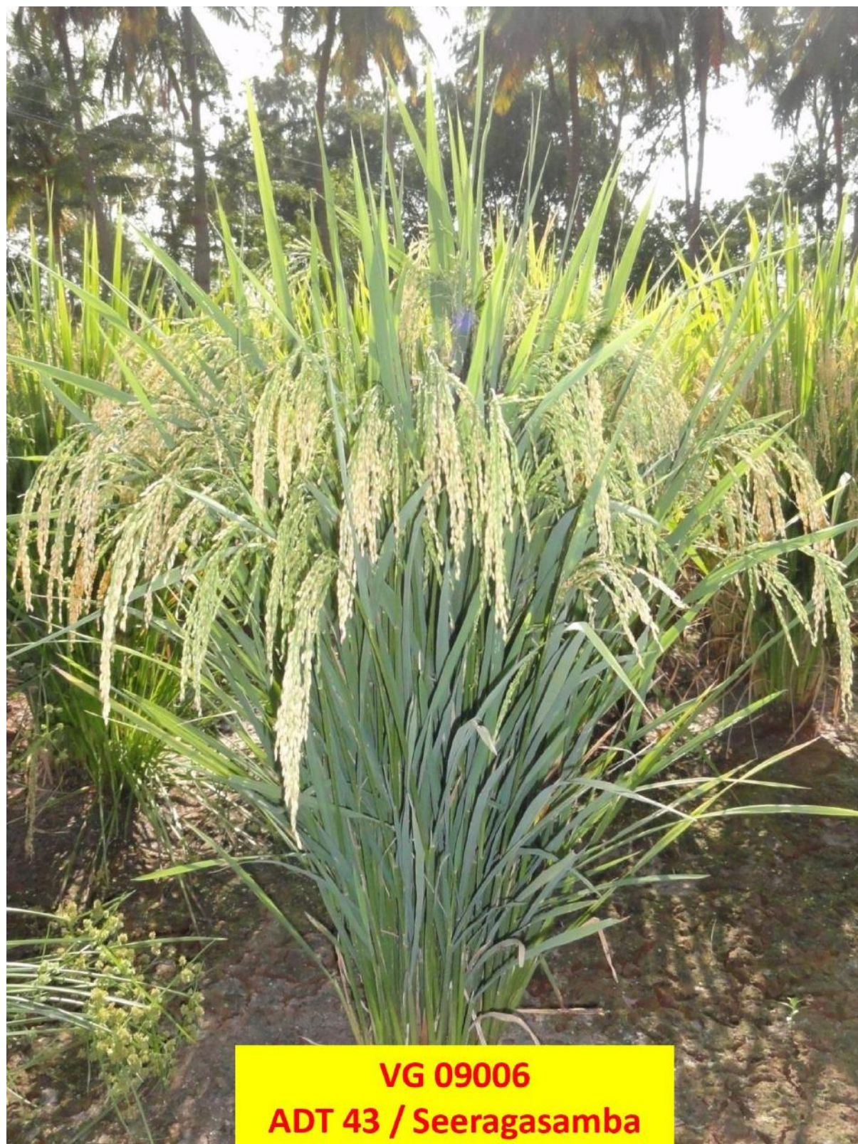
Plate 1. Field view of VGD1