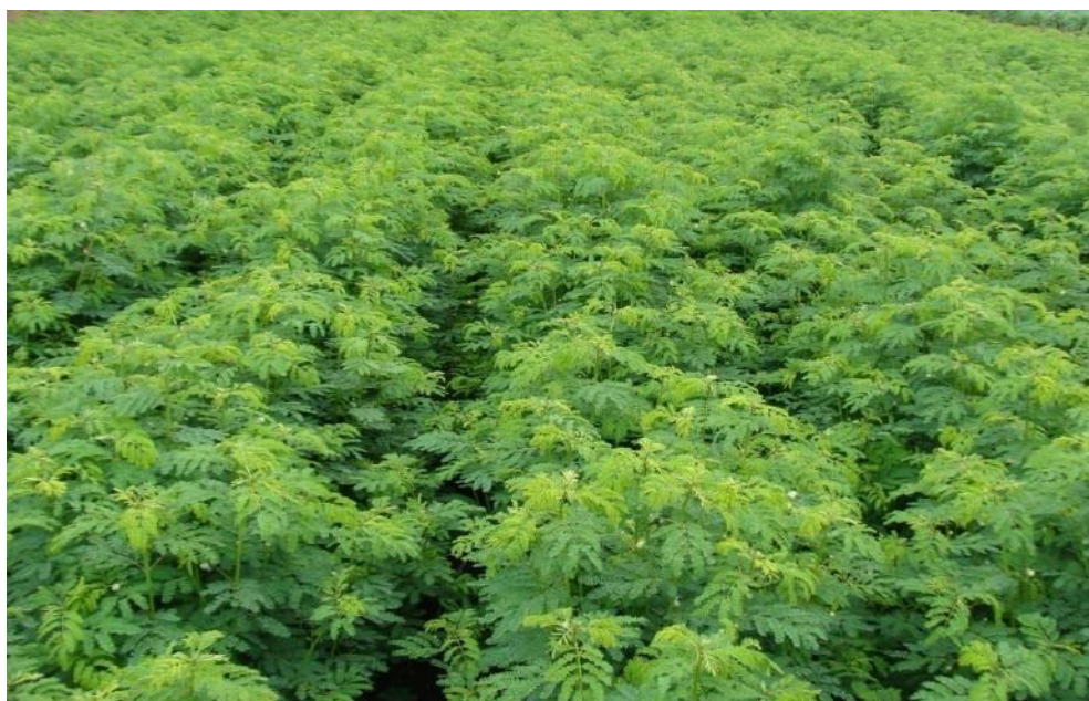
Fig. 1. Field view of Desmanthus TND 1308

With regard to quality aspects, TND 1308 registered its superiority for dry matter yield (DMY) of 115 q/ha and dry matter yield of 0.55 q/ha/day which was 15.15 and 14.58 per cent over the national check CO 1, respectively. It ranked first for dry matter yield (q/ha) and dry matter yield (q/ha/day) among the cultures evaluated under AICRP on FC & U trials. The dry matter portion of the feed indirectly indicates the quality of fodder (John moran, 2005). The culture has registered the dry matter yield of 14.12 q/ha and crude protein content of 15.58 per cent which is 10.37